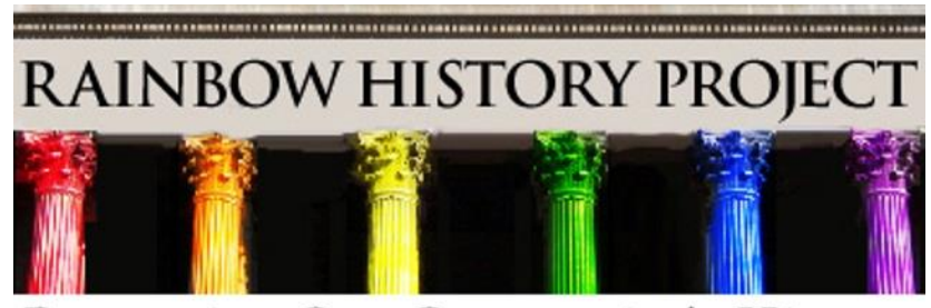
Preserving Our Community's History